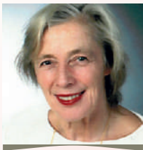
Prof. Liselotte Mettler Germany

5 DAYS ONLINE COURSE - EVERY DAY UAE TIMEZONE 4:00pm to 8:00pm