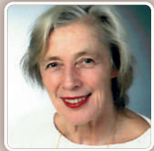
Prof. Liselotte Mettler Germany

5 DAYS ONLINE COURSE - EVERY DAY UAE TIMEZONE 4:00pm to 8:00pm