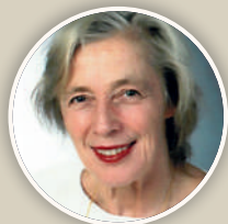
Prof. Liselotte Mettler Germany

5 DAYS ONLINE COURSE - EVERY DAY UAE TIMEZONE 3:00pm to 7:30pm